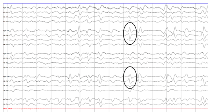
Figure 2. Atypical TWs: 0.75hz-1hz GPDs of TW morphology more prominent over the right frontal region in 82-year-old patient with hypoxic Ischemic encephalopathy secondary to Acute respiratory failure

There are two types of TWs waves described in the literature. Typical TWs commonly seen in hepatic encephalopathy are smoothed, negative, positive negative, diffuse symmetrical, and synchronous regular periodic or rhythmic at 1.5 hz to 2 hz fronto-centrally dominant (Figure 1). However, atypical TWs are seen mostly in other metabolic encephalopathies, degenerative disorders, cerebrovascular lesions, and tumors. These are frontopolar or parieto-occipital maximum, negative-positive or negative-positive-negative, asymmetric (Figure 2), and asynchronous, unreactive, irregular, multifocal, continuous with spatiotemporal evolution, sharper, and without anterior posterior lag [5].