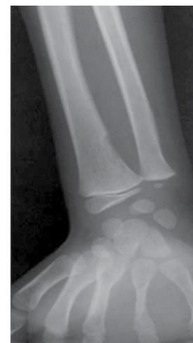
Figure 1: Antéro posterior X-ray of the right hand. Soft tissue swelling over the dorsal metacarpals and irregular erosion of the second metacarpal. Another erosion is seen in the lower extremity of the ulna.

These findings suggested a malignant soft tissue mass that most