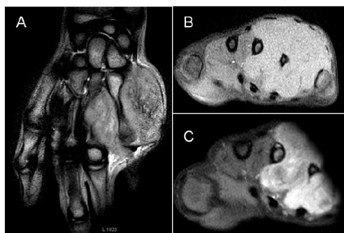
Figure 3: MRI of the right hand showing a mass arising from the dorsal and palmar interossei and occupying both the dorsal and palmar compartments. The mass was heterogeneous hyperintense to the surrounding muscles on T1WI (A) and T2WI (B). After gadolinium injection the mass demonstrated marked homogeneous enhancement (C).

courses of combination therapy using Vincristine, Adriamycin and Cyclophosphamide (VAC), together with radiotherapy.