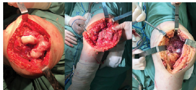
Figure 2. Trans-operative images of the resection of the lesion in the left knee with extensive synovectomy.