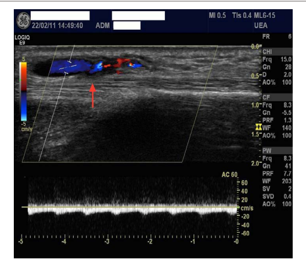
Figure 3: High frequency linear longitudinal ultra-sound image of the forearm soft tissue mass demonstrating localised dilatation of a patent vein with a mixed venous-arterial waveform.

Figure 2: High frequency linear longitudinal ultra-sound image of the forearm soft tissue mass demonstrating localised dilatation of a patent vein with a mixed venous-arterial waveform.