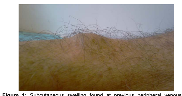
Figure 1: Subcutaneous swelling found at previous peripheral venous cannulation site found to be an arteriovenous fistula.

Careful examination is required in order to detect the pathognomonic machinery murmur, or bruit, and thrill over the site