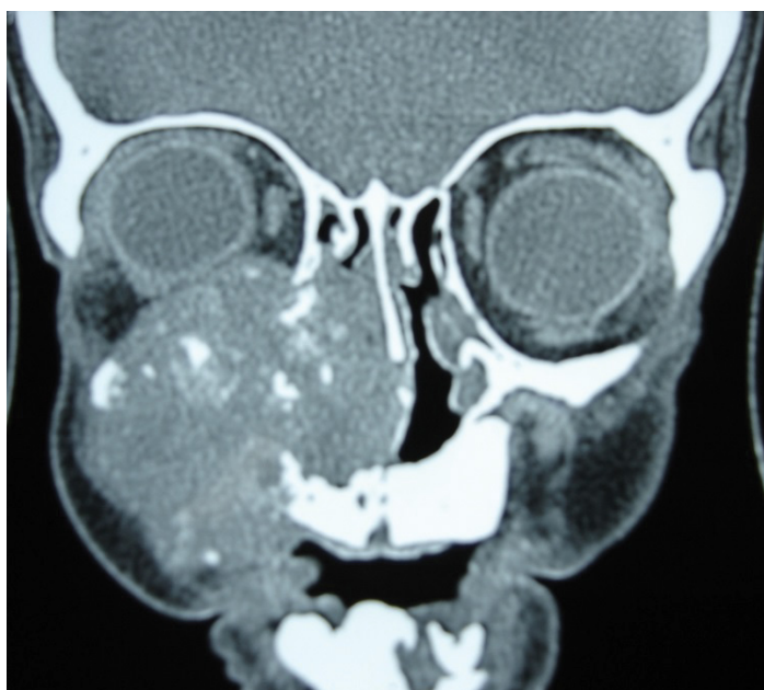
Figure 2: CT scan with a high-grade osteoblastic osteosarcoma of the right maxillary sinus in a 21-year old male patient with history of oropharyngeal rhabdomyosarcoma treated with chemotherapy and radiation therapy at age of 10-year old. This patient underwent chemotherapy and EBRT.