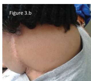
Figure 3: 63-year old female patient with a rhabdomyosarcoma of the posterior neck (a) With history of a posterior fossa meningioma treated with surgery and radiation therapy at age of 42-year old (b) This patient underwent surgery with wide resection of the tumor and reconstruction.