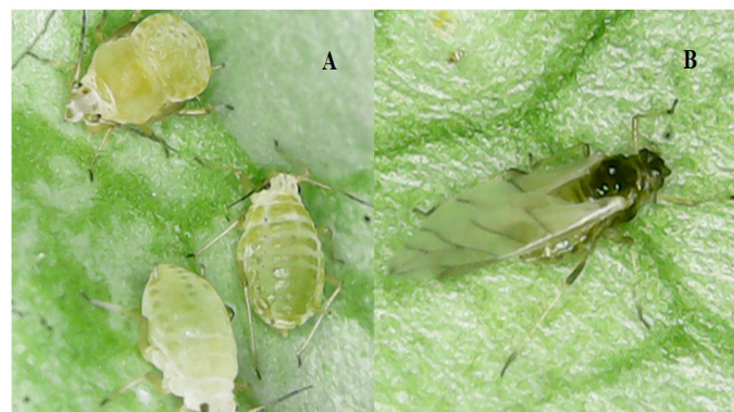
Figure 1. (A) Lipaphis erysimi , known as the green cabbage aphid, (B) Lipaphis erysimi , a green aphid with two pairs of membranous wings.

They are wingless individuals with an oval body (Figure 1A). The few winged females are responsible for the dispersal of the offspring, which have two pairs of membranous and transparent wings (Figure 1B).