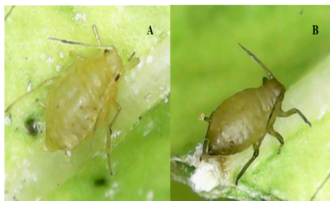
Figure 2. (A) Light coloration and desiccation are observed, (B) After 48 hours, its coloration is already dark and rubbery.

When observed under a USB microscope, it was found that when the essential oils were sprayed, they left the aphids disoriented. Soon afterwards, it was observed that the oil is easily absorbed through the cuticle without breaking it, leaving the aphids unable to move. After 24 hours (Figure 2A), they were all desiccated and rubbery, turning dark after 48 hours (Figure 2B).