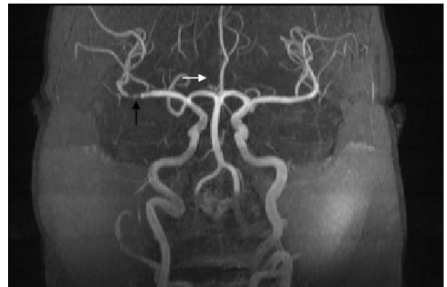
Figure 2: MR Angiogram of the head and neck. MRA demonstrates stenosis of M1 segment (black arrow) of right MCA and absence of right ACA (white arrow points to normal location).

To differentiate between vasculitis and atherosclerosis causing stenosis, intracranial arterial wall imaging (black blood MRI) was performed using a 3T MR scanner. The arterial wall imaging protocol consisted of pre- and post-contrasted axial and coronal T1-weighted images with inversion recovery, BB-MRI demonstrated circumferential wall enhancement of the supraclinoid portion of right internal carotid artery, A1 and proximal A2 segments of the right ACA, and M1 and proximal M2 segments of the right MCA, compatible with vasculitis (Figure 3). Subsequent analysis of the cerebral-spinal fluid (CSF) demonstrated 20 WBC/ml with lymphocytic pleocytosis with normal protein and glucose levels. CSF antibodies for lymphocytic choriomeningitis, measles, mumps, West Nile virus, and herpes simplex virus were negative. CSF antibodies for VZV were positive but there was no evidence of IgM antibody. PCR for the virus in CSF was positive revealing 4500 copies/milliliter.