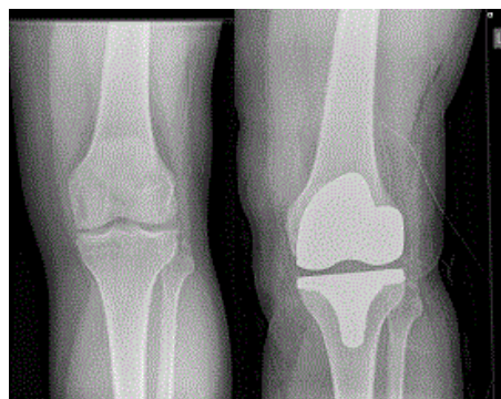
Figure 1: Patient's left knee radiographs pre and immediately post operation

A 59 year old male with a medical history of hypertension, non-insulin dependent diabetes mellitus, angina and benign prostatic hyperplasia whom underwent simultaneous bilateral primary total knee arthroplasty surgery for osteoarthritis (Figure 1). The patient received Atracurium 50 mg IV at the induction of general anaesthesia for muscle relaxant purposes.