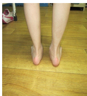
Figure 2: Pronation deformity in feet.