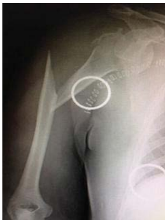
Figure 2: Rx shows fracture in three parts with anatomical neck fracture.