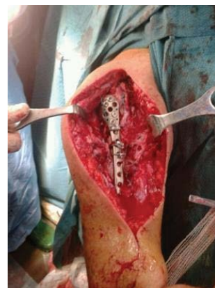
Figure 4: DLCP with hemiarthroplasty and cerclages.

than open reduction and fixation [9]. The treatment modalities include closed reduction and plaster of paris slab application, nailing and plating of the humeral shaft along with reduction of the shoulder dislocation. Good clinical results have been reported with almost all the modalities. However, there is no consensus in the literature for treating this type of injury [10-12]. In fact, we did a combination of several options to