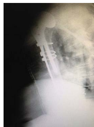
Figure 6: Radiological result.