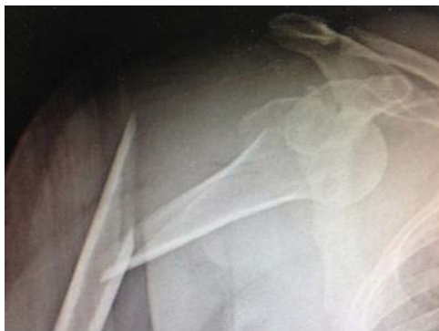
Figure 1: Rx shows fracture – dislocation with ipsilateral shaft fracture.