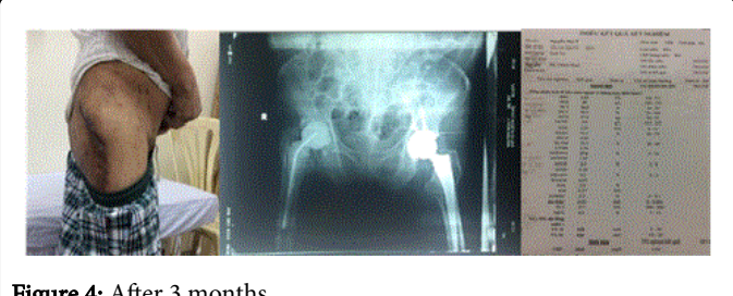
Figure 4: After 3 months.

On February 2017, his clinical improvement was too bad with pus from drainage incision. He has been admitted to that hospital, and