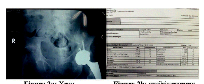
Figure 2a: Xray

After 2 time debridement and VAC drainage, he was impregnated with antibiotic-loaded cement spacer, which was made by aluminium mold and loaded Teicoplanin 1,2 g, and Vancomycin 2 g (Synovial fluid tests result: Enterococcus Faecium , multiple antibiotic resistance). He was discharged after 2 weeks with the infection in control, dry wound. He keeps on using oral antibiotic treatment in 6 weeks (Figure 2a and 2b).