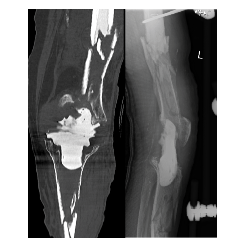
Figure 3: Plurifragmentary fractures after prosthesis explantation.