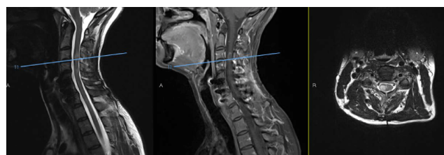
Figure 1 (Left to right): MRI T2 weighted sagittal of the cervical spine with increased signals; MRI T1 sagittal and axial sequences showing contrast enhancement and extending area of demyelination in C3 during a relapse in April 2015.

At week 30 of gestation, Ms SR developed a NMO relapse with increasing numbness and tingling in both arms and legs, especially on her right side. She underwent a 3 day course of intravenous steroids with good effects. She delivered a healthy baby girl on 4 April 2016, but developed increasing right hand numbness in the week post-partum. MRI showed a new T2 lesion at C2. She received her first rituximab infusion on 19 April 2016 (Figures 1-3).