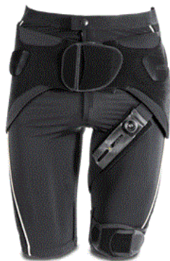
Figure 2: Unloader hip brace (Ossur).

An alternative proposed brace is the Unloader Hip Brace (Figure 2), developed and produced by Ossur. The brace is aimed at increasing hip external rotation and abduction with an elastic strap that wraps around the lower thigh in a medial to lateral, distal to proximal direction [52]. Whilst it is a very recent development, early study of the brace looks promising: it effectively appears to decrease levels of internal abduction, which is a major contributor to the compressive forces through the joint. This may lead, as it did immediately in some of the study patients, to reduced pain whilst wearing the device during walking [53,54]. There is, of course, the need for more in-depth study of the characteristics and effects of the brace, though it may become an attractive management plan to delay the need for THR.