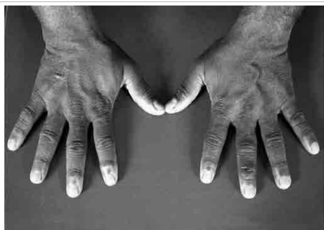
Figure 1: Nodular swellings of distal interphalangeal joints (DIP) in both hands.

A 51-year old Indian male, a heavy vehicle driver, was referred to rheumatology clinic from General Practitioner with history of painless swellings at the distal interphalangeal (DIP) joints of both hands with a referral diagnosis of nodal osteoarthritis. The swellings were insidiously growing for the past six years and did not interfere with hand movements and functions. There was no history of preceding trauma and there were no similar swellings elsewhere in the body. There were no constitutional symptoms such as night sweats, fever, loss of appetite or weight loss. The patient was not obese and there was no history of diabetes or dislipidemia. His systemic review was normal. Examination of hand revealed 3x4 mm in size lobulated, nodular swellings located on dorsal aspect of all digits adjacent to DIP joints (Figure 1) [Patient's consent was obtained for publication]. Skin over the swelling was normal. Nodules were smooth, soft to firm, nontender, not adherent to the overlying skin, but held in place by the basement structures. There was no transillumination through the swelling. There was normal sensory perception in the digit and range of motion was normal in the