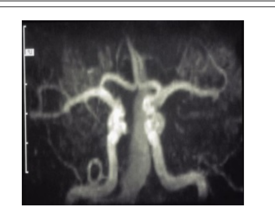
Figure 1B: Basilar Dolichoectasia- Coronal: A representative example of basilar megadolichoectasia as seen depicted by magnetic resonance angiography.