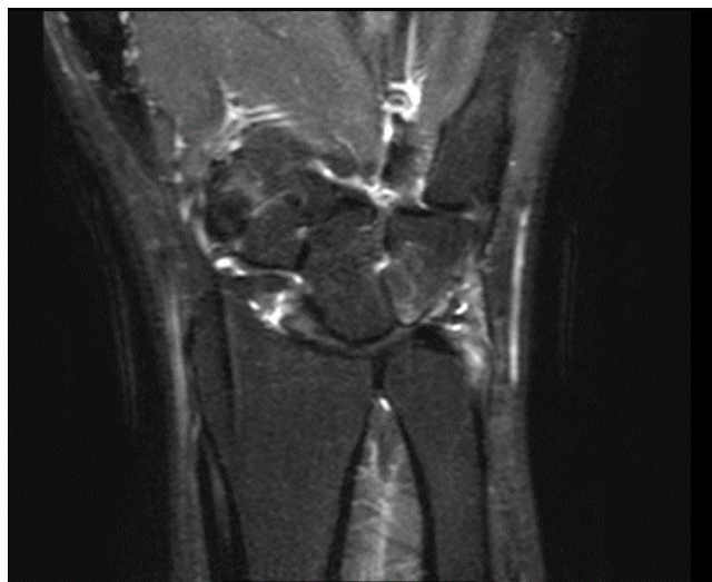
Figure 2: MRI of 2011 T2 of the right wrist showing synovitis at the trapezoidal radial joint.