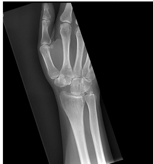
Figure 1: X-ray of 2011 of the right wrist after proximal row carpectomy.

Could this new technique be able to offer insight in the exact localization of the pathology (Figure 1) in uncomprehend wrist pathology? SPECT/CT is a technique where computed tomography (CT) scan is combined with metabolism and a 3-dimensional image [7,8]. Radiation exposure is only 2-5 mSV [9]. This technique has already been applied into several clinical orthopaedic pictures; femoro acetabular impingement, meniscal tears, ligament injuries, osteochondral lesions, osteochondritis dissecans etc. [5].