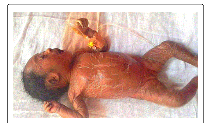
Figure 1: Large scales covering the entire body in a newborn with Lamellar Ichthyosis.