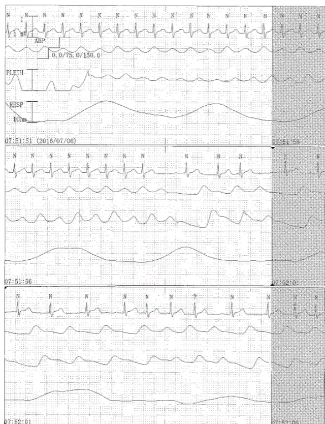
Figure 4: Rhythm degenerated into AF.

In the morning of the postoperative day two, a third episode of PSVT appeared. As in previous cases, we first asked the patient to perform Valsalva maneuver. However, this time his rhythm