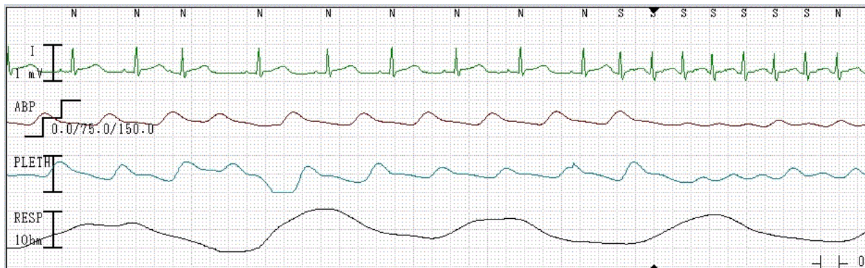
Figure 3: Two episodes of PSVT.

than 80 mmHg), and palpitation (Figure 3). We attempted to stop PSVT by Valsalva maneuver. The attempt was successful for the first episode, but not for the second. For the latter episode, we injected 10 mg of adenosine, which terminated the PSVT.