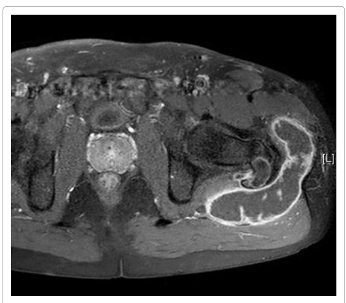
Figure 4: Contrast enhanced MRI visualized the subcutaneous abscess-like formation in the thigh (fat-suppressed T1 weighted TSE).

An aspirate culture of the abscess-like formation was negative. However a chronic bacterial infection was suspected and therefore