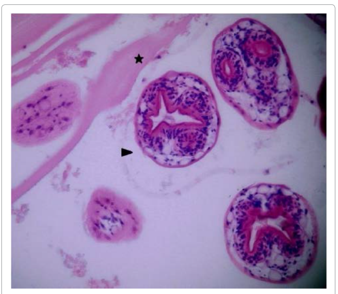
Figure 6: Hematoxylin and eosin staining of scolices (arrow) and the membrane of the cyst (asterix).