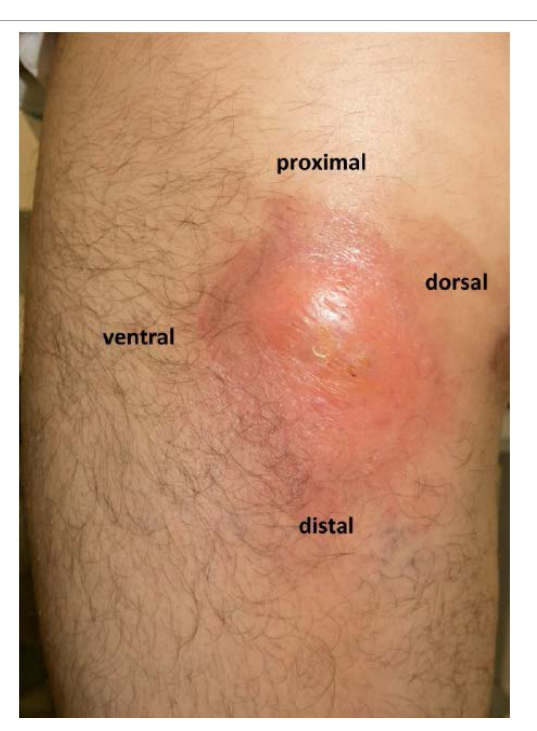
Figure 1: Clinical presentation of case 2. Around the trochanter region exists a not well defined inflammated area.

Case 2: A 44 year old man presented with a painful soft tissue lump of the left lateral thigh present for months. The overlying skin had signs of inflammation (erythema, fluctuation, and induration) imminent to spontaneous perforation (Figure 1). Clinically the