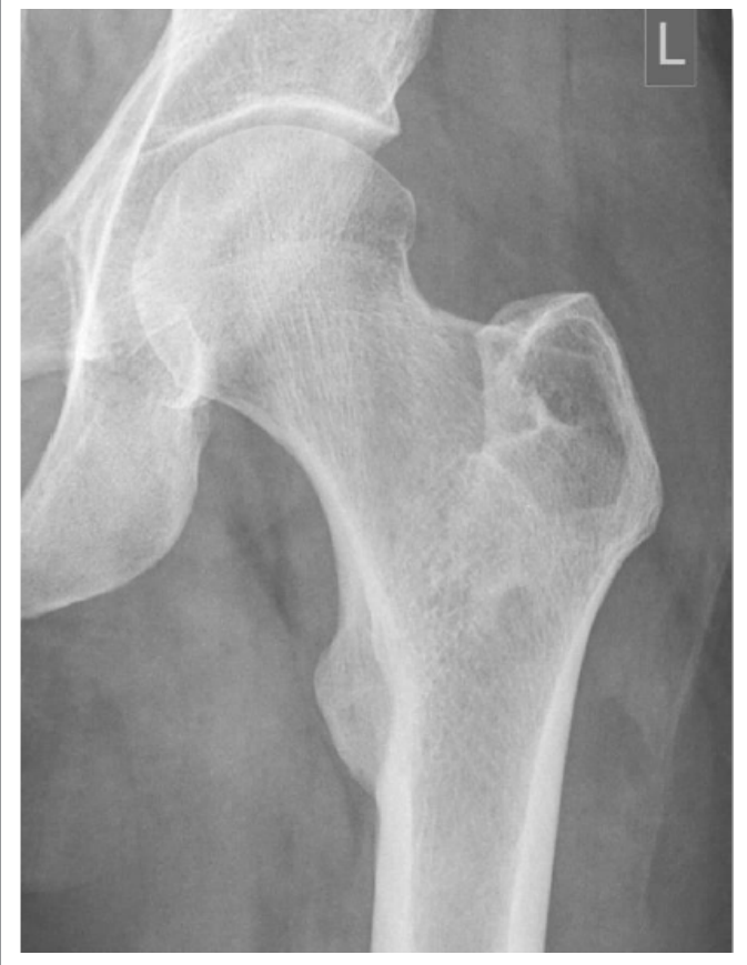
Figure 3: AP plain radiograph showing an osteolysis involving the greater trochanter.

Hematoxylin and eosin staining of the specimen showed components of the cyst's wall as well as scolices, the heads of tapeworms (Figure 6).