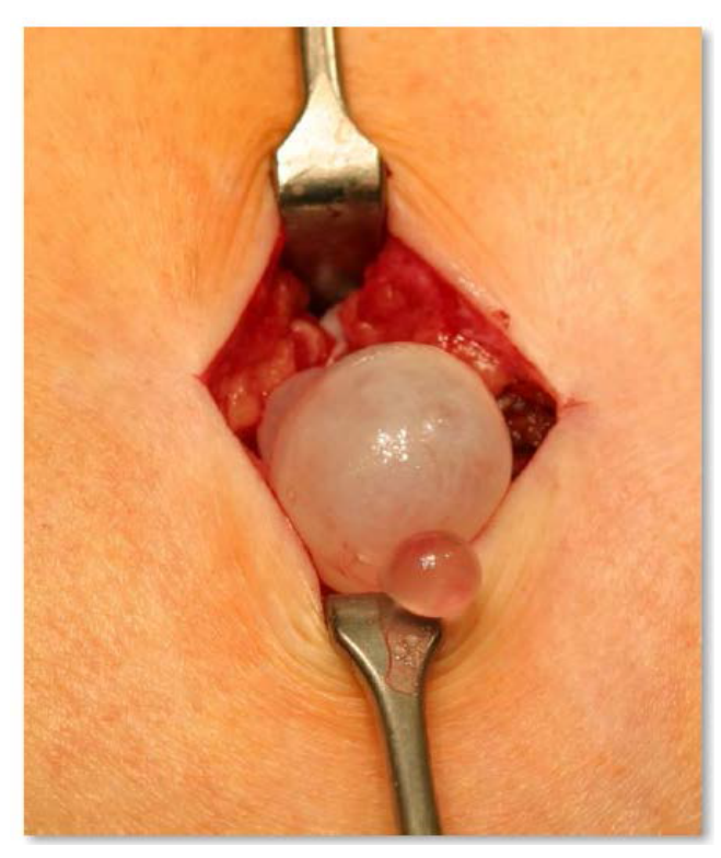
Figure 5: Intraoperative situs of the incisional biopsy. Direct under the skin a cyst formation was present.