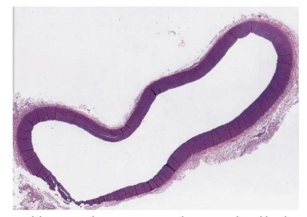
Figure 7. Right Lower Pulmonary Artery post instrumentation with spheres that were opened 20% greater than the baseline vessel luminal diameter. No vascular anomalies are noted.