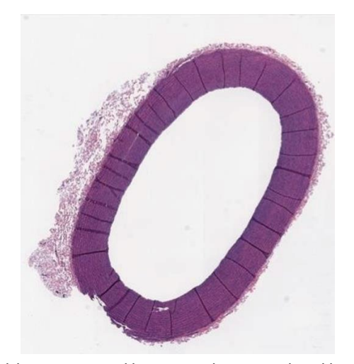
Figure 3. Right Common Carotid Artery post instrumentation with spheres that were opened to match the vessel's luminal diameter. No vascular anomalies were identified.

In all specimens, the vascular wall integrity was intact, and the histology of vascular elements remained essentially normal. In some specimens there was artifactual disruption of the vascular endothelium characterized by localized loss of endothelium and fragmentation of the vascular wall, without associated inflammation or hemorrhage. More specifically, device manipulation within the lumen of the evaluated vascular structures did not appear to cause significant structural damage to the integrity of the blood vessel or cause significant inflammatory response. Figures 3-7 provide H and E micrographs of instrumented vessels.