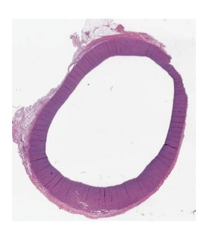
Figure 5. Pulmonary Artery post instrumentation post instrumentation with spheres that were opened 20% greater than the baseline vessel luminal diameter. No vascular anomalies are noted.