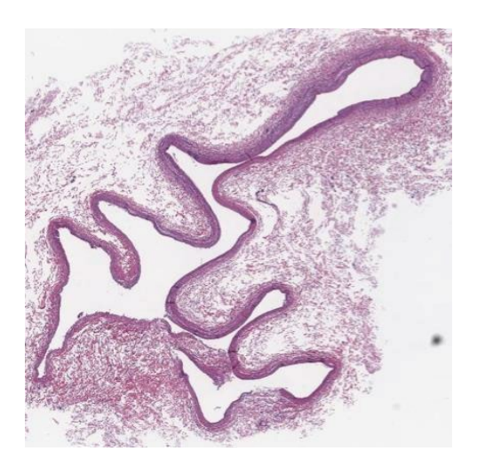
Figure 4. Right Jugular Vein post instrumentation with spheres that were opened 20% greater than the baseline vessel luminal diameter. No vascular anomalies are noted.