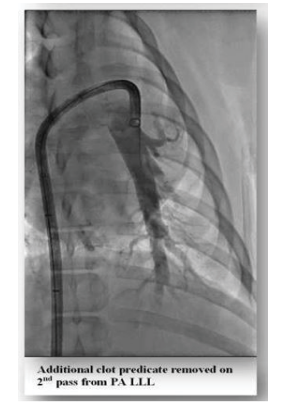
Figure 2. Pulmonary arteriograms before, during and after device deployment. Note: Orange arrows indicate thrombus burden; Blue arrows point to the expanded proximal and distal device spheres in the PA