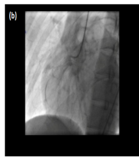
Figure 2. Angiography revealed coronary artery disease in three vessels (a/b)

It has also been linked to mutations in several genes. History of family LVNC was associated with history of family dyslipidemia; in addition was strongly associated with history of family CAD. On the contrary, our patient had LVNC and CAD without dyslipidemia. Importantly, the prognosis of patients with non-compaction cardiomyopathy is poor in general and improves significantly with heart transplantation. Thus, therapy should be directed at the prevention and management of the most frequent manifestations of the disease.