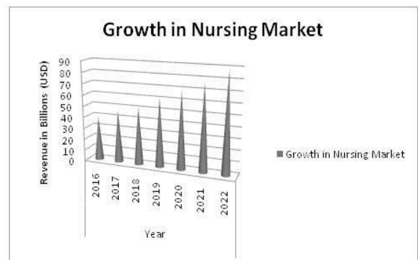
Fig: The Nursing Market analysis report

Registered nurses are highly preferred now-days in Europe. Europe has twenty two universities and one hundred hospitals, hospitals represent thirty.54% of the overall greenbacks spent on health .