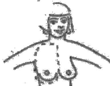
Figure 2: Steps of Breast Self Examination (BSE)

Stand in front of a mirror and start BSE just below the collar bone.