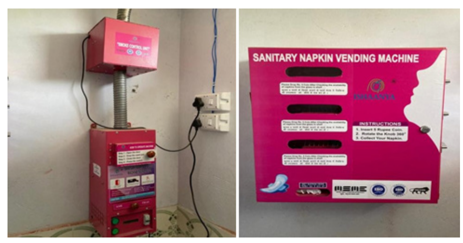
Figure 1. Facilities for mensuration.

Key findings protected that there has been inadequate get right of entry to secure and personal centres for MHHM coupled with displacement precipitated shifts in menstrual practices with the aid of using girls. There become a slender interpretation of what an MHHM reaction includes, with a focal point on supplies; substantial hobby in information what a progressed MHHM reaction could consist of and acknowledgement of constrained current MHHM steerage throughout diverse sectors; and inadequate session with beneficiaries, associated with pain asking approximately menstruation, and constrained coordination among sectors.